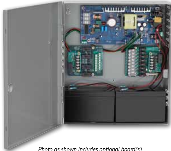
Photo as shown includes optional board(s) Please contact your local sales office or visit the support section on our website for configuration assistance.

* All PS900 Series of power supplies and option boards have been tested and certified to meet UL 294.